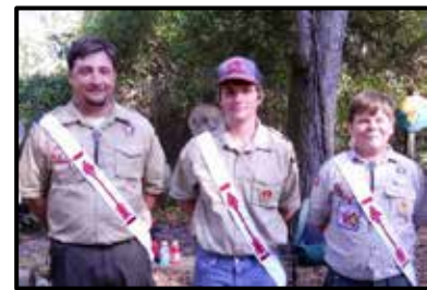
Our New Brotherhood Members

Annual membership dues for Withlacoochee Lodge are $10.00. You may pay your dues at either service center or through the mail by sending a check to the SGC Valdosta Service Center. Make checks payable to “South Georgia Council-OA Dues”. OA members may only wear the lodge flap of the lodge where their dues are paid.