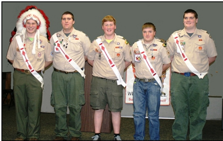
2015 Withlacochee Lodge Officers

The Withlacochee Lodge annual banquet was held Saturday, January 10 th , 2015 at the First United Methodist Church Social Hall. Nearly 100 Arrowmen and guests attended the banquet. The event was scheduled to coincide with the Lodge Leadership Development Course and the South Georgia Council's University of Scouting in order to further integrate Order of the Arrow programs into council events and give our membership a chance to attend more than one Scouting event at the same location. The catered meal was superb and members and their guests had a great evening of fellowship. The program included a slide show of our 2014 events; awarding chokers, certificates, and member cards to our seven new Vigil Honor members; recognizing the 2014 ceremony team with a 2014 ceremony team patch; presentation of two Founder's Awards; presentation of a James E. West Fellowship; and installation of the 2015 Withlacochee Lodge officers. The lodge would like to thank the Blackwater Chapter, and especially the Arrowmen of Troop 62, for hosting such a successful event.