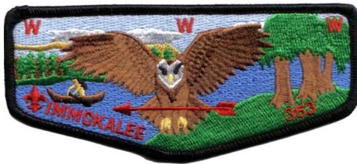
Immokalee Ordeal Member Pocket Flap

Upon completion of your Ordeal, you will be entitled to wear the Immokalee Lodge flap (patch) on the flap of your right shirt pocket.